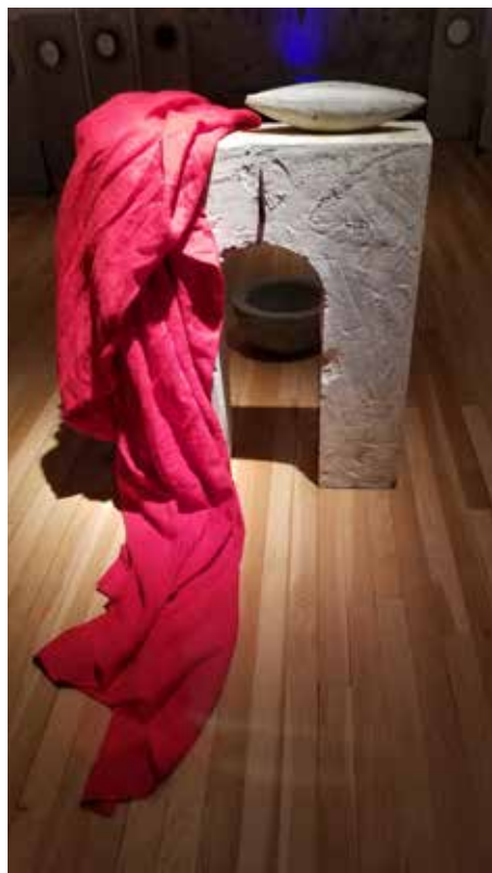
Sacrificial Arch cement casting with steel hook, seed form cement casting, and red fabric