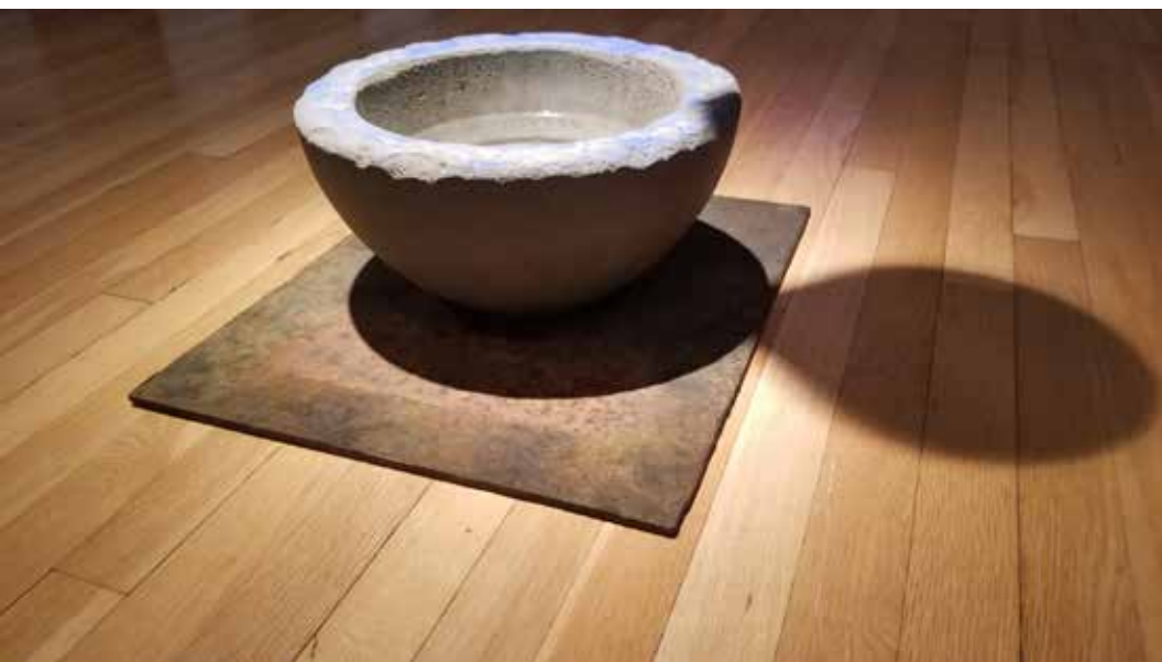
Another cement bowl lying beneath The Plummet , casting a shadow that sometimes "eclipses" the bowl. . .