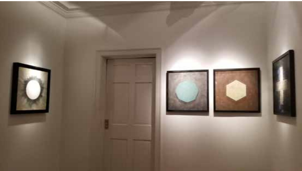
Panels with ancient graphic symbols commonly used in pre-industrial civilizations. Framed works ( to the right of the door ) are encaustic and oil on perforated carbon steel that has been weathered outdoors, some are etched with lines or notations. Implosion (to the left of the door) is spray paint and oil on canvas. (this is the image used on the invitation. . . )