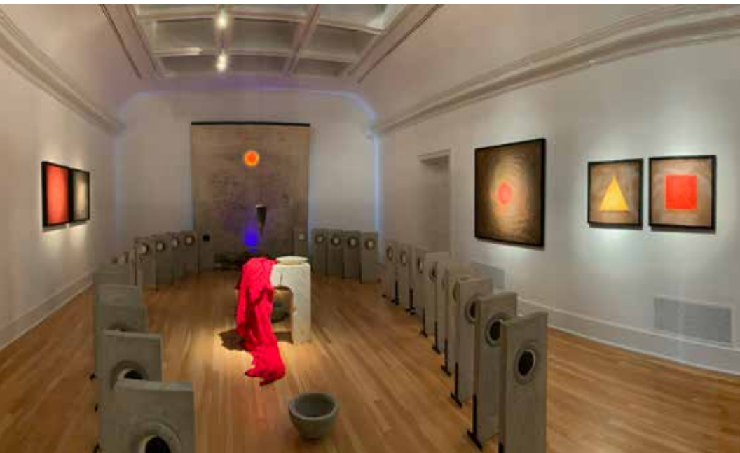
GRAVITY (whole installation) The entire back gallery is an installation. The light has been controlled to create a likeness to sunset or sunrise.