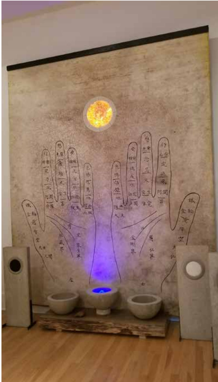
Obfuscating the grand Palladian window at the back of the gallery is the large hanging canvas, Hands , (10 x 8 ft.) with 3 bowls at its base. In the center bowl, covered in water, is a large crystal lit from underneath. At each side are two of the 28 Phases of the Moon , cement castings with steel supports (34 x 12 x 2 in. each) which encircle this abstract altar.