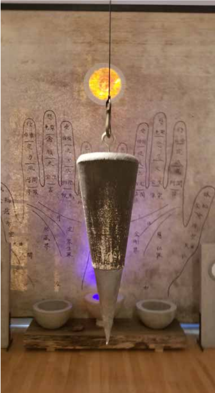
(Foreground) The Plummet , cement casting hanging from ceiling armature and (background) Hands , large hanging canvas (10 x 8 ft.) at the back of entire Forces of Nature installation. . . concentric circles at top illuminated subtly from the back.