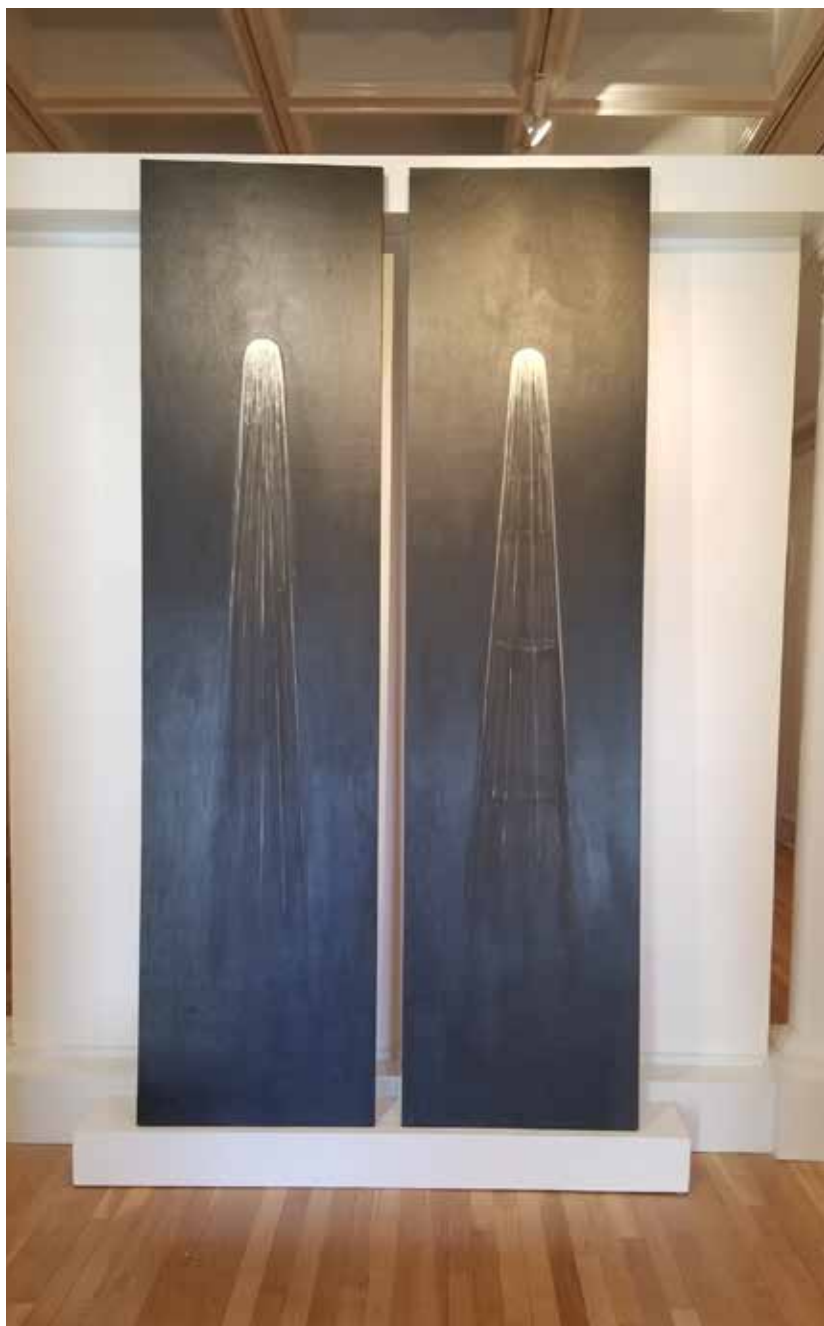
Lux / Motus ♂ (Mars) & Lux / Motus ♀ (Venus) are a majestic pair of oil paintings on oak panel (96 x 24 in. each) that greet viewers at the front entrance of the gallery.