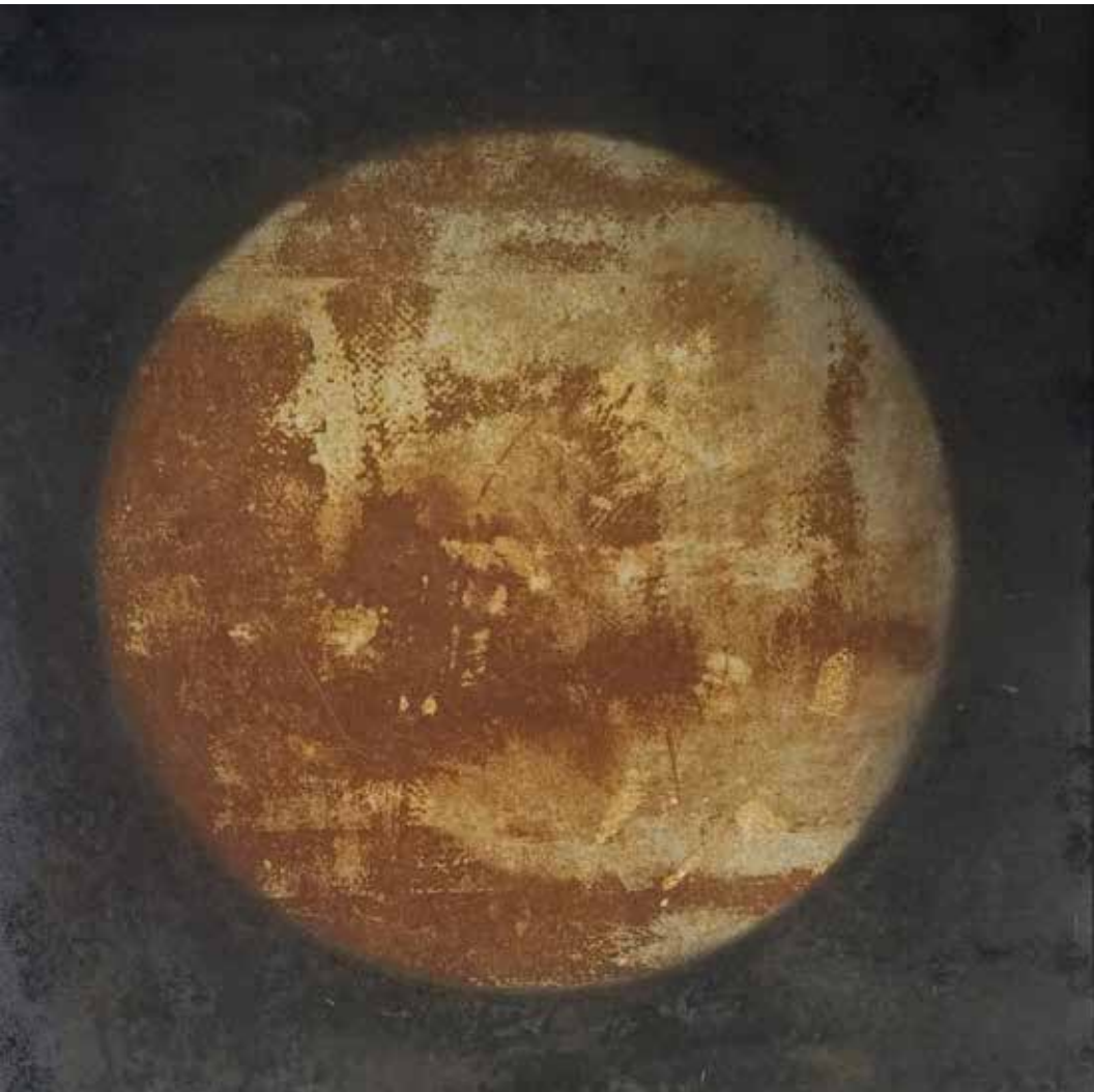
Planet B (48.5 x 48.5 in.) is an oil painting on perforated carbon steel. Purposeful weathering outdoors left large gestural marks of rust, which are then fixed.