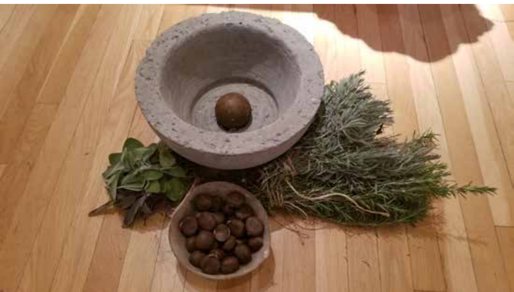
A cast cement bowl, with fresh offerings from Richard's garden. . .