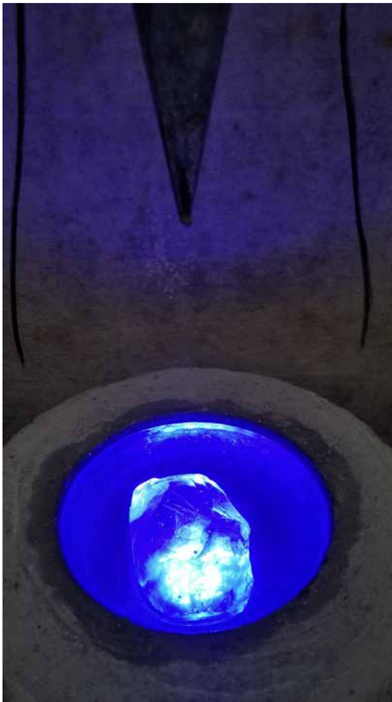
Detail of the crystal in the center bowl at the back of the installation in the back gallery.